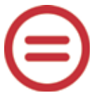
Urban League of Greater Kansas City