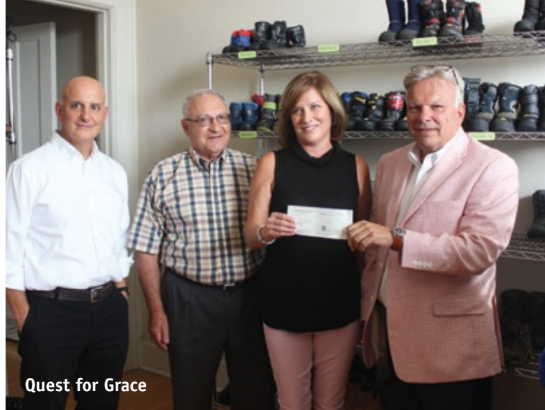
Quest for Grace